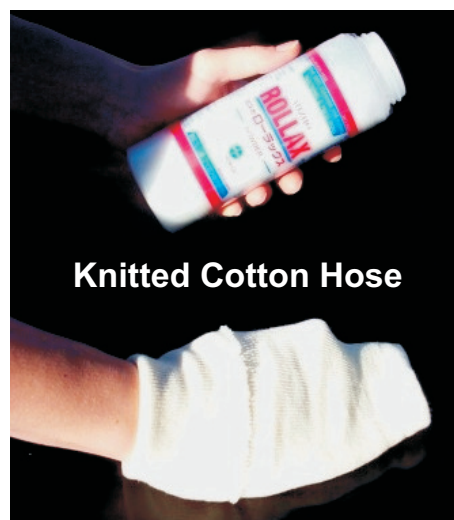
Knitted Cotton Hose